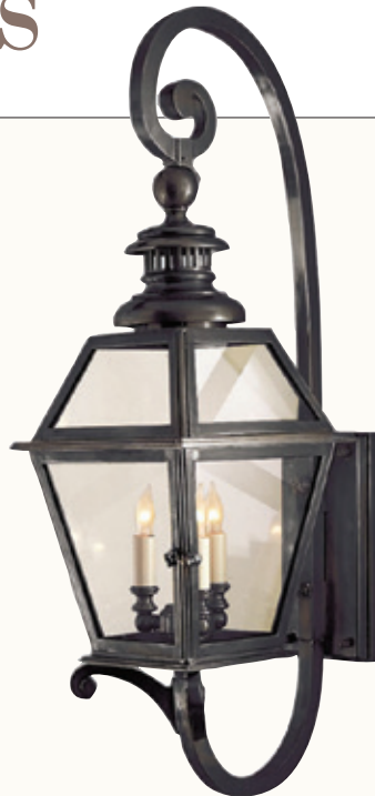
Lantern: Visual Comfort exterior bronze lantern from The Mansion; vessel sink: Kohler's Milles Fleurs from Plumb Supply; ebony chest: Lillian August Co.; house elevation and blueprint: Ahmann Design