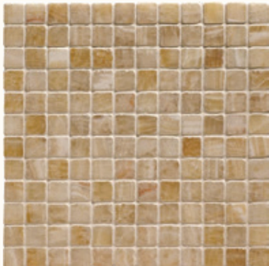
Master bath shower and counter backsplash; 1" x 1" mosaic onyx tile for master bath, at Randy's Carpet.