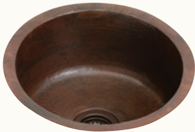
Elkay hammered copper bar sink, at Plumbers Supply H 2 O.

When building or remodeling a home, there are a multitude of products to choose from. I begin by helping each client with a master plan of the color scheme, including flooring, paint, wood stains, and stone. Then it is easier to make good choices for smaller details such as this specialty sink and accent tile.