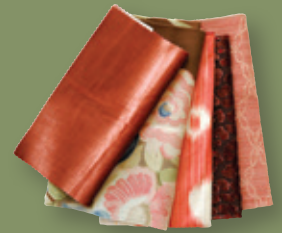
More fabric color trends: Corals and rose