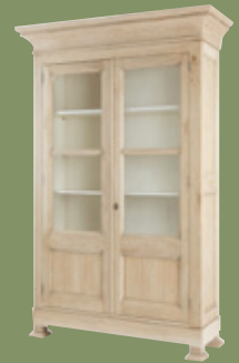
White-washed wood finishes return