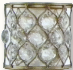
Above: Wall sconce. (Sconces and chandelier from Light Expressions by Shaw.)