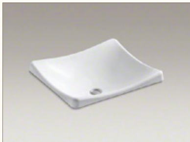
Bottom right: Master bath details.