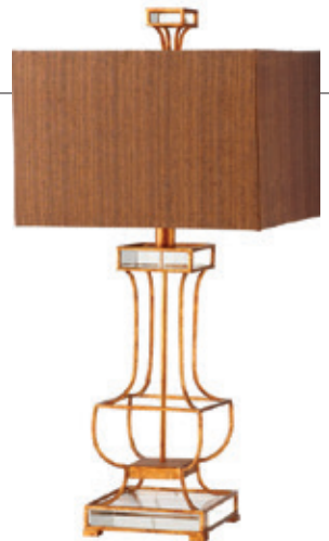
"Fontainebleau" Floor lamp in antique-burnished brass $1,155 (left)