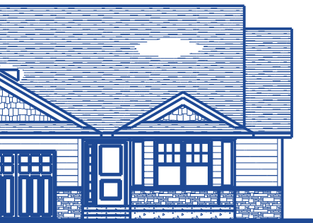
House plan by Ahmann Design