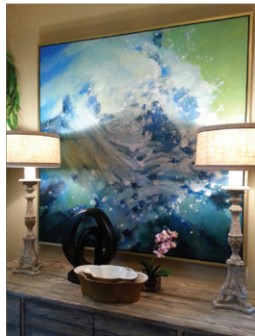
Green & Blue Abstract $2,244 at The Mansion