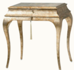
Gold-silver table by Caracole, at The Mansion.