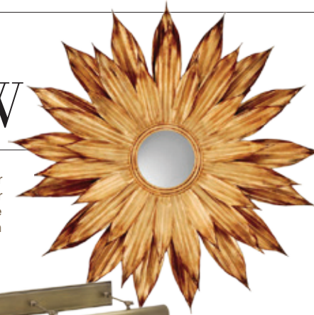
Golden Flower Petals Mirror $550 at The Mansion