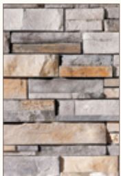
Exterior Dry Stack Stone Prestige at Iowa Stone Supply, Hiawatha.