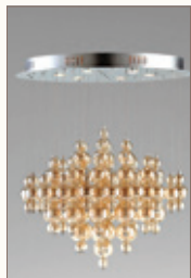
"Bubbles" chandelier by Cyann Design at The Mansion.