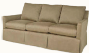
Contemporary sofa in cream chenille by CR Lane, at The Mansion.