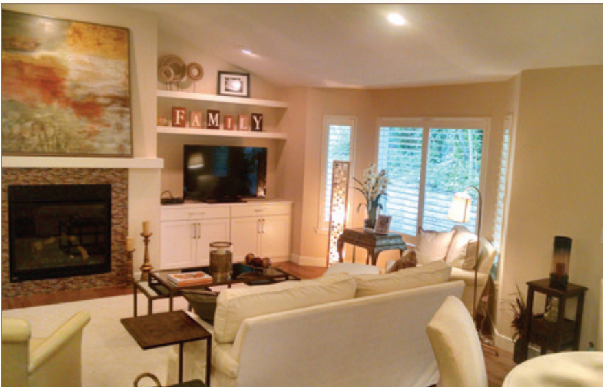
Right: Upholstered dining chairs are comfortable and provide extra living room seating. The stunning chandelier is my client's favorite purchase for her retirement home.