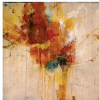
Glory Day $675 at The Mansion